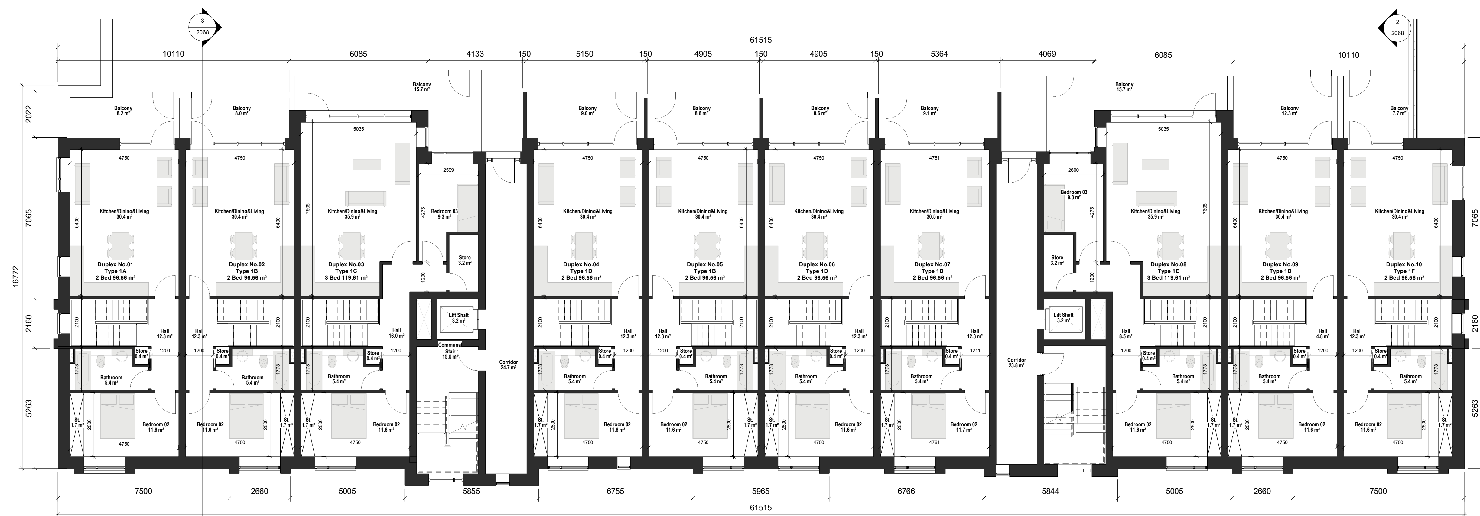
2 Block C (Duplexes/apartments - Type B) - Building 1 - First Floor Plans 1:100